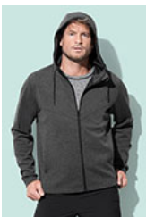
ST5840 Recycled Scuba Jacket